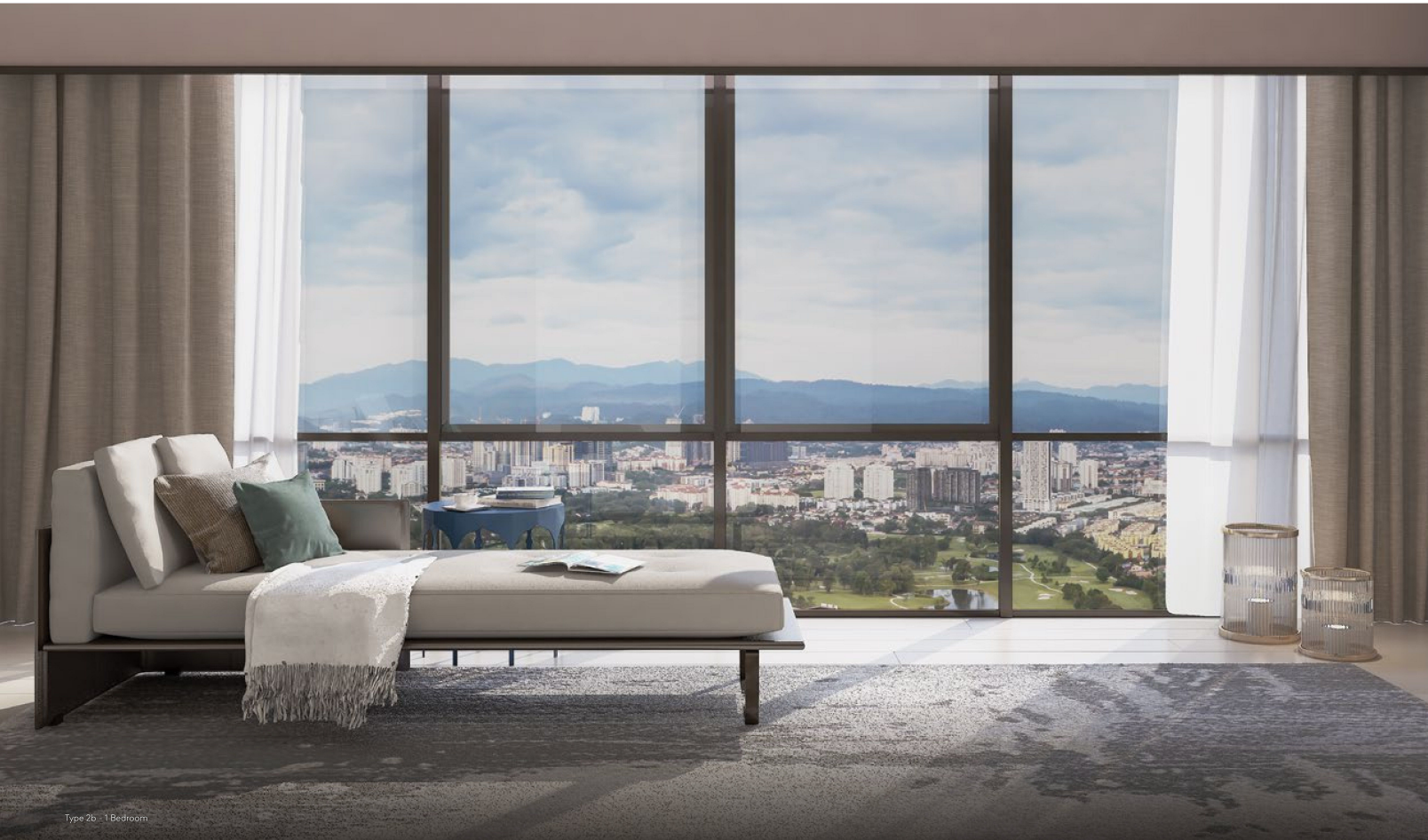
Type 26 - 1 Bedroom

TRX Residences continues this ethos; crafted with care so that your heart feels at home.