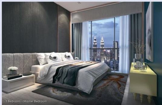
1 Bedroom - Master Bedroom

We take the aesthetics of good design further, ingeniously blending it with functionality to deliver optimal space in the right places. Your global lifestyle is well accommodated with accurate design and flexible applications.