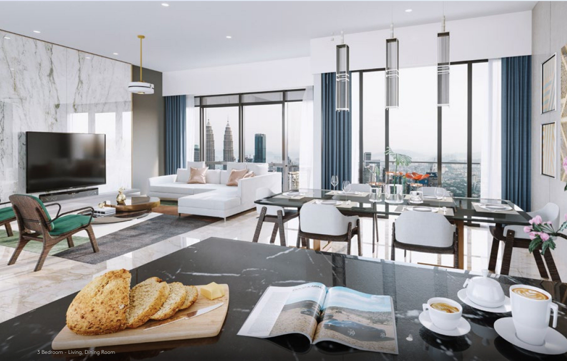
3 Bedroom - Living, Dining Room

90,000 sq. ft. of facilities, just a lift ride away.